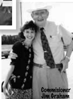
Commissioner Jim Graham