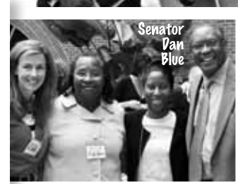
Senator Dan Blue