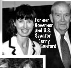
Former Governor and U.S. Senator Terry Sanford