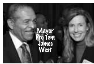
Mayor Pro Tem James West