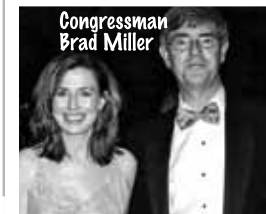
Congressman Brad Miller