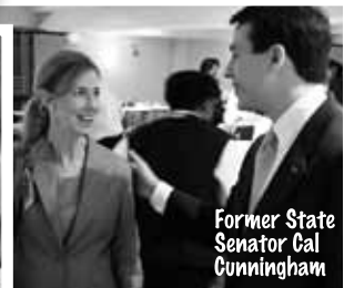
Former State Senator Cal Cunningham